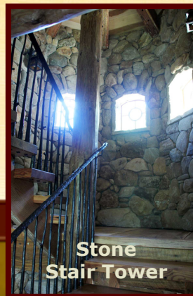
Stone Stair Tower

To be enjoyed in every season of the year and in every season of life ... for generations